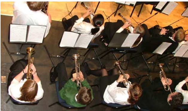
(Left) An unusual view of brass and wind players