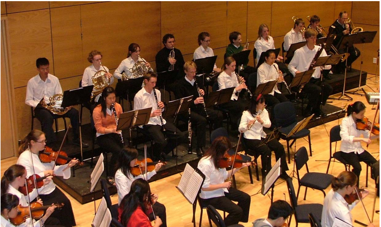
UYO dress rehearsal for the 15 th October, 2006, Spring Charity Concert. $462.95 was raised in door takings, all being donated to Melville High School's 'Go for Broke' fire rebuilding programme.