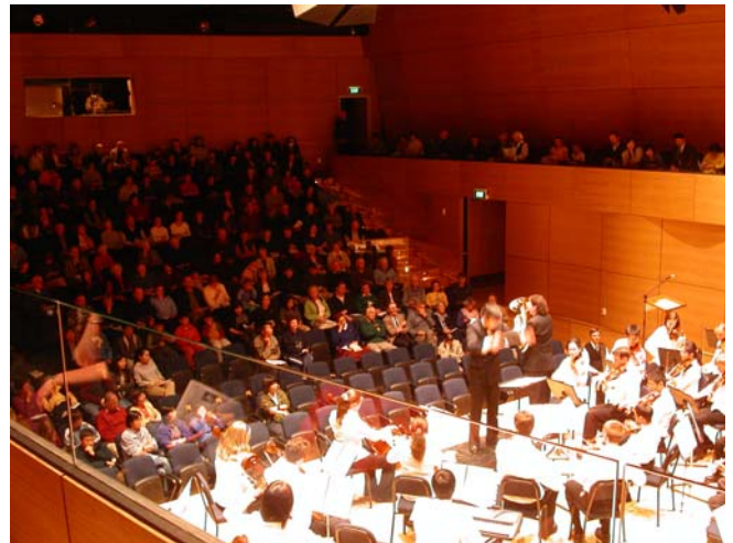
(Left) Some of the upper strings of UYO and TYO together in concert 12 th October 2003, and (right) the appreciative audience that day.