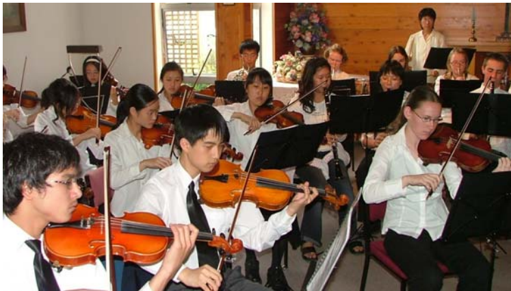
At the Resthaven concert 1 st April